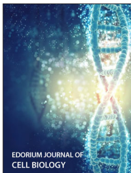
EDORIUM JOURNAL OF CELL BIOLOGY