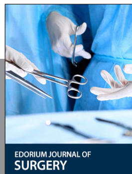
EDORIUM JOURNAL OF SURGERY