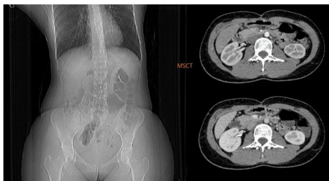
Figure 2: Latest evaluation of abdominal contrast multislice CT (MSCT) with no mass or lymphadenopathies (Oct 25, 2021).

The latest serial evaluation of abdominal contrast MSCT on October 25, 2021 was clear (Figure 2). The patient remained in complete remission with an active life (ECOG 0) for almost four years until this report was submitted.