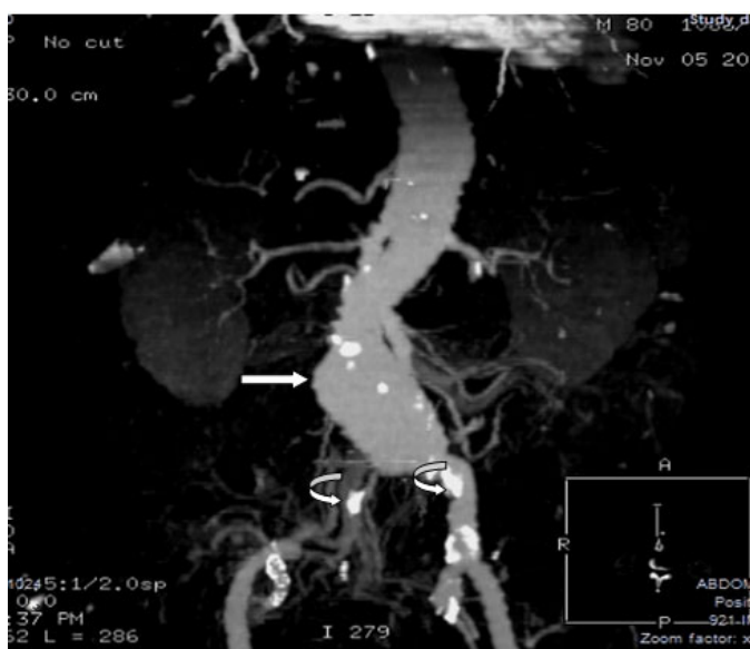
Figure 4: 2D reconstructed CT angiogram of abdominal aorta with volume rendering, showing fusiform dilatation of the infrarenal portion of the abdominal aorta (straight arrow). Multiple hyperdense lesions of calcific density are seen on aortic and common iliac arterial walls (curved arrows).