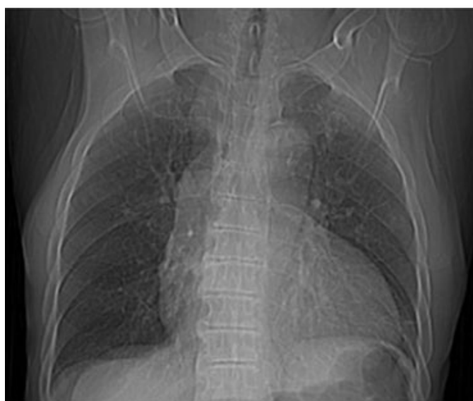
Figure 2: A scanogram of the chest in a CT study showing moderate cardiomegaly of left ventricular preponderance (CTR = 0.66). The aorta is also elongated with prominent knuckle. No opacity of calcific density is noted on the demonstrated aortic walls.