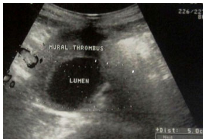
Figure 1: Abdominal US, axial plane, showing a dilated abdominal aorta (5 cm in diameter AP) with an anterior mural thrombus.

The management of abdominal aortic aneurysm requires multi-disciplinary approach, involving interventional radiologist, cardiologist, and cardiopulmonary surgeons. The management of the index case was planned along this line but he refused surgical management on account of his age while he complied fully with medical care. All attempts made at persuading him for possible surgical management proved abortive, aimed at averting aneurysm rupture.