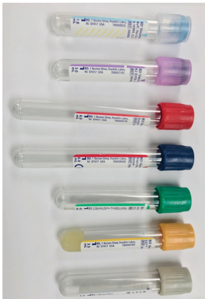
Figure 1: Tubes (vacutainers) for blood specimen collections.

during the clotting process. But in CLL, even the plasma levels of potassium are elevated. Severe leukocytosis leads to consumption of metabolic fuels that impair Na-K ATPase activity, leading to release of potassium from a large number of white blood cells [11–14]. Spuriously elevated K + concentrations were seen with elevated white blood cell count in a longitudinal study [15]. Another proposed mechanism is the damage to the membrane of the millions of fragile malignant cells by the heparin in the tubes used for the collection of these samples [5, 9, 16]. In several studies, it was found that the K + level in plasma was higher in heparinized tubes than the K + levels obtained simultaneously in non-heparinized tubes and the extent to which the K + concentration was increased was proportionally related to the amount of heparin present in the tubes [6, 8]. Mechanical stressors can also attribute to the damage to these cells.