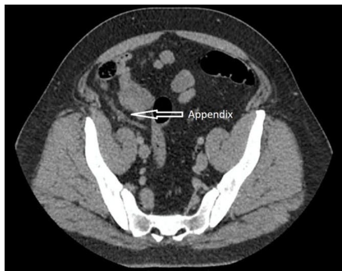
Figure 1: Axial view of computed tomography (CT) showing some inflammation of the appendix.

A 44-year-old male presented to Accident & Emergency Department with a one-day history of nonmigratory right iliac fossa pain, associated with anorexia. On abdominal examination, he had right iliac fossa tenderness with positive rebound, however, Rovsing's sign was negative. His inflammatory markers were normal (white cell count of 8.5). His urine dipstick had traces of leukocytes and negative nitrites; formal urine microscopy showed a leukocyte count of 60 but culture was negative. Further investigations included an abdominal CT which revealed the diameter of appendix to be 7 mm with inflammatory changes in the mid part of the appendix (Figure 1). The official radiology report suggested acute appendicitis. Based on examination and CT confirmation, a decision was made to undergo definitive laparoscopy in the following morning with overnight intravenous antibiotics while waiting on the emergency board. Intraoperatively, the appendix had a normal macroscopic appearance. However, an anticlockwise rotation of a necrotic epiploic appendage was noted (Figure 2). The necrotic tissue was transected and endoloop was applied. A planned appendectomy followed in consideration of the clinical suspicion of appendicitis and the associated positive CT finding. The patient had an uneventful postoperative recovery and was discharged on postoperative day one. The histology confirmed the presence of both epiploic appendicitis and mucosal appendicitis. The patient had