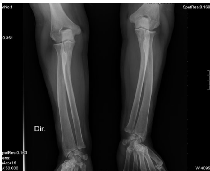
Figure 3: X-ray revealing undertubulation of radio and ulnae more pronounced distally.