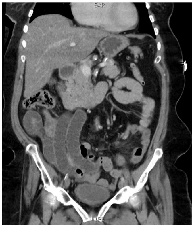
Figure 1: CT image of the abdomen demonstrating collapsed loop of small bowel in the left pelvis, and dilated small bowel in the right abdomen.

In females, a defect whereby an internal herniation may occur can be created by abnormalities of the female reproductive organs in the pelvis. These are rare occurrences, however, and examples of such cases