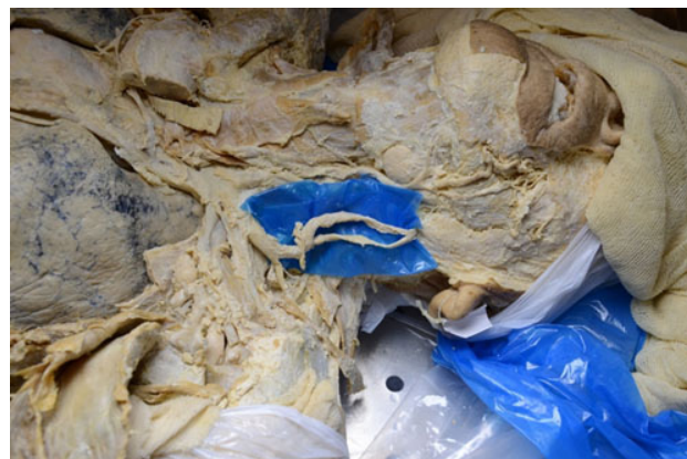
Figure 2: Color photograph showing superficial neck dissection, with external jugular vein fenestration highlighted. Consent for images to be taken was provided by the donor as part of the donor registration program at the University of Birmingham license number 12236.

Moreover, existing literature frequently confuses “fenestration” and “duplication” when describing anatomical anomalies, thus literature reviews searching for further cases of this anatomical phenomenon can be difficult to conduct. In a review of case reports describing