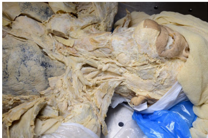
Figure 1: Color photograph showing superficial neck dissection. Consent for images to be taken was provided by the donor as part of the donor registration program at the University of Birmingham license number 12236.

Importantly, the cadaver had a large anterior mediastinal mass, seemingly pathological in nature, surrounding and encasing the great vessels. We suspect the cadaver suffered from superior vena cava syndrome as a result; the veins in the neck were engorged, particularly on the left, as can be seen in Figure 3. The EJV on the right had a smaller diameter than on the left. The veins on the right were also more muscular in appearance, likely a result of the high pressure caused by obstruction downstream.