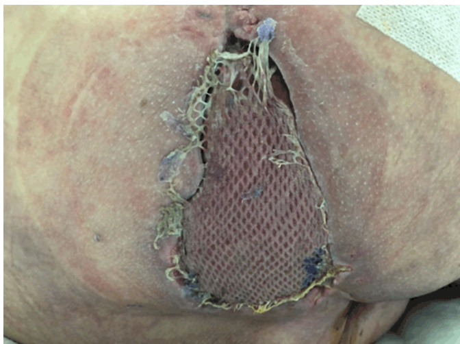
Figure 3: Skin graft site one week following the procedure.

contamination has been known to be one of the risk factors for perineal wounds, especially in patients with sphincter dysfunction, faecal incontinence and long-term bed-ridden patients. Surgical stoma formation such as temporary diverting ileostomy or colostomy is traditionally used to avoid faecal contamination. However, the complications of stoma formation and reversal of stoma significantly increase the patient's overall morbidity, motility, length of hospital stay, and healthcare costs. Specific complications of stoma formation include leak, stoma failure, infection, parastomal hernia, bowel obstruction, necrosis, stenosis or prolapse of stoma. Additionally, reversal of the stoma also can be complicated by anastomotic leakage, wound infection, bowel obstruction, intraabdominal collection and bowel injury.