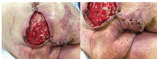
Figure 1: Approximation of the wound edges was achieved with 0' nylon sutures.

Necrotising fasciitis is a disease associated with acute fulminant infection of the genital, perineal and abdominal regions [1]. Early diagnosis with aggressive surgical debridement and appropriate wound care is the cornerstone of the treatment in these cases [1]. Faecal