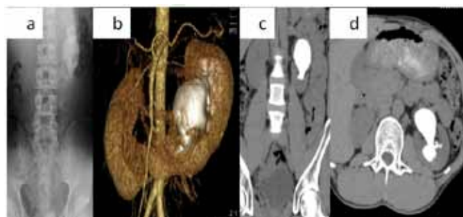
Figure 1: Preoperative images (a) KUB, (b) 3D-CT scan, (c) Coronal CT scan, and (d) Axial CT scan. The stone was occupied the whole left renal pelvis.

Setting nephrostomy in the upper calyx has a disadvantage of longer distance from skin to the lower calyx. So nephroscope sometimes cannot reach to the target stone. UARN helps to control the target spot for puncture under the ureteroscopic approach [9]. Thus, the puncture spot is always ideal for performing PCNL with minimum complications. We previously reported two initial horseshoe kidney cases of PCNL using UARN [10]. The present case of staghorn calculi in the horseshoe kidney supports our results.