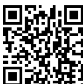
Edorium Journals: On Web

We welcome you to interact with us, share with us, join us and of course publish with us.