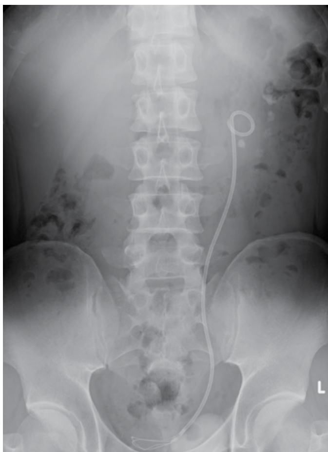
Figure 2: Postoperative KUB.

UARN is, therefore, considered to be an effective treatment modality for staghorn calculi in the horseshoe kidney.