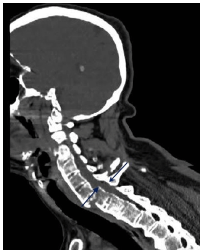
Figure 2: Magnetic resonance imaging (MRI) of the patient indicated non-displaced fracture line in vertebral corpus C7, and a non-displaced fracture line in spinous process C6, and non-displaced fracture line in vertebral facet joint level, spinal cord compression and edema signal.