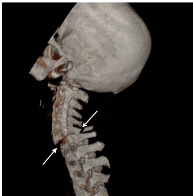
Figure 1: Computed tomography scan showed a fracture in C6-C7 vertebral corpus, posterior subluxation of C7 corpus and line in spinous process C6.