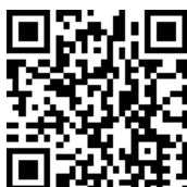
Edorium Journals: On Web

We welcome you to interact with us, share with us, join us and of course publish with us.