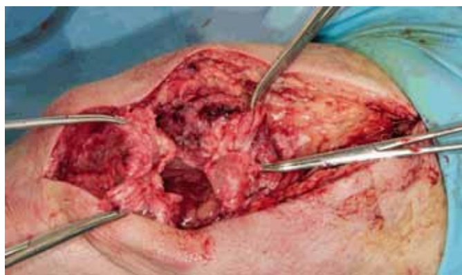
Figure 2: Intraoperative photo of left knee showing the complete tear of quadriceps tendon at its insertion to the patella along with disrupted, displaced bipartite patella.

Operative treatment was discussed with the patient and informed consent was obtained. The patient was treated surgically under general anaesthetic in the supine position. Tourniquet was used for 90 minutes during the operation. A longitudinal midline incision approach was used. Operative findings included a complete tear of quadriceps tendon at its insertion to the patella with disruption of the bipartite patella which had displaced a result of the injury (Figure 2). The displaced fragment of the bipartite patella was judged to be significant in size therefore reduced to its anatomical position and internally fixed to the main patellar fragment using two 4.0 mm ASNIS screws under direct intraoperative X-ray control (Figure 3). The distal quadriceps tendon then was repaired into the superior pole of patella using two 5.0 mm Miteck anchors. Repair of the retinaculum on the sides was completed using 2.0 Vicryl. The wound was closed in layers with Vicryl and Monocryl with the knee in slight flexion. The knee was then placed into a cylinder splint and he was scheduled to a follow-up clinic. Meanwhile he was encouraged to do range of motion ankle exercises.