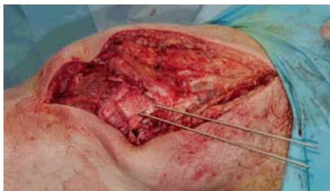
Figure 3: Intraoperative photo of left knee showing reduction of displaced fragment of bipartite patella to its anatomical position.