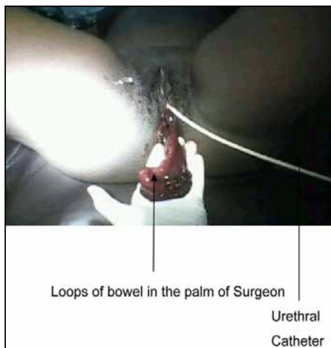
Figure 1: Bowel protruding per vaginum.

Patient fared fairly well postoperatively with relatively stable vital signs and was making adequate urine. On the fourth postoperative day she started running temperature and her condition suddenly deteriorated and she died the same day.