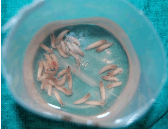
Figure 3: Removed maggots in a single sitting for two consecutive days.