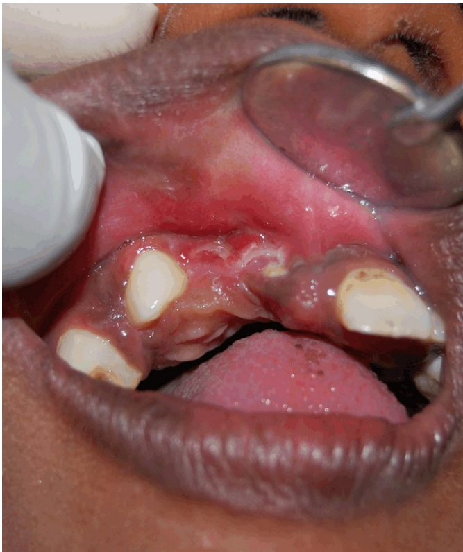
Figure 4: Healed wound after complete removal of maggots.

moisture, necrotic tissue and suitable temperature. Thus, wounds, open sores, scabs, ulcers contaminated with discharges facilitate the same. The developmental transition via the larval stage requires an intermediate host. In our case an empty socket and existing periodontitis contributed to the mechanical support and suitable substrate and temperature for the survival of the larvae. The stage of larvae lasts for six to eight days during which they are parasitic to human beings. The larvae have backward directed segmental hooks with