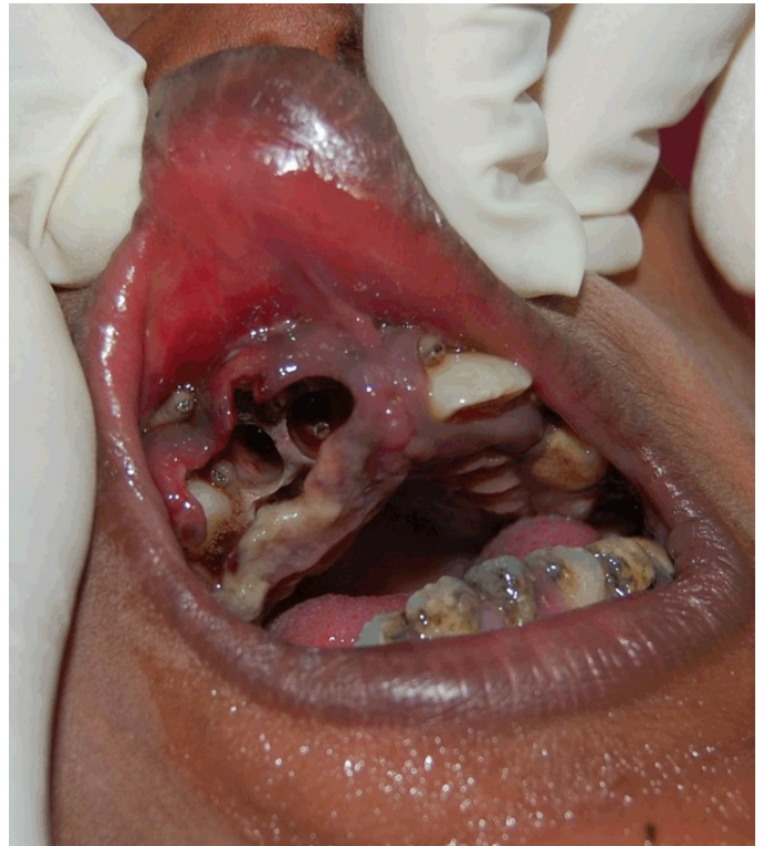
Figure 1: Pretreatment photograph depicting the maggots moving around the wound.

Musca Nebulo is the most common Indian housefly. They are seen in abundance in human dwellings and are very active during summer and rainy season [15]. The life cycle of a fly begins with egg stage followed by the larvae, pupa and finally the adult fly. The conditions required for egg laying and survival of the larvae are